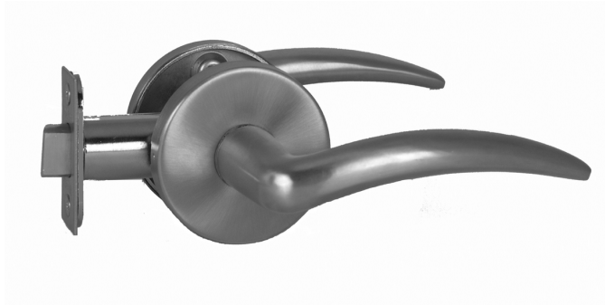
Available in 605, 606, 610, 613, 619, 626, 629, 630